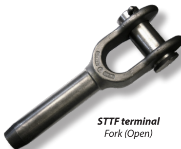
STTF terminal Fork (Open)