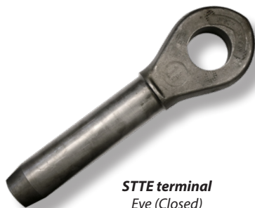
STTE terminal Eye (Closed)