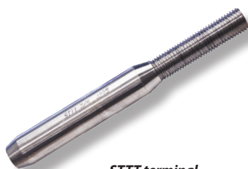
STTT terminal Threaded swage terminal