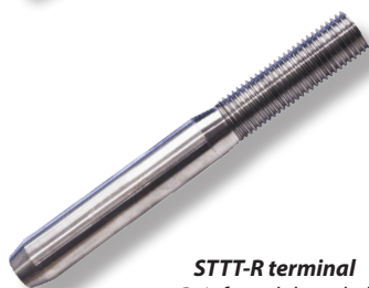
STTT-R terminal Reinforced threaded swage terminal